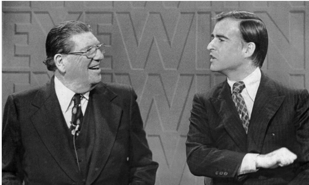
Howard Jarvis and Gov. Brown